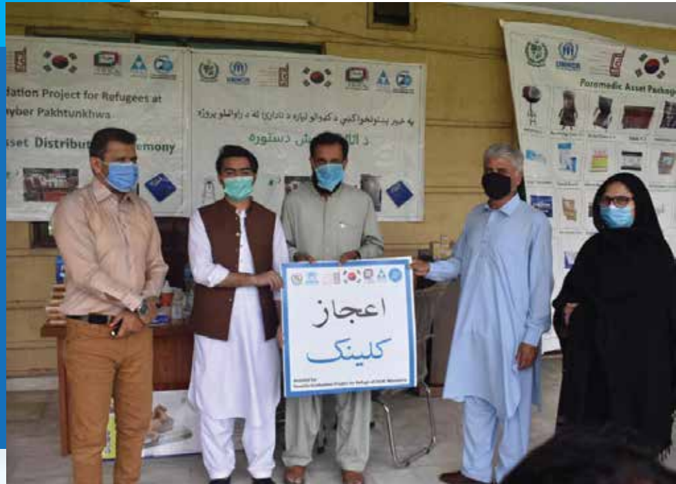
Productive assets distribution ceremony in Khyber Pakhtunkhwa.

2,584 households (Over 18,088 individuals)